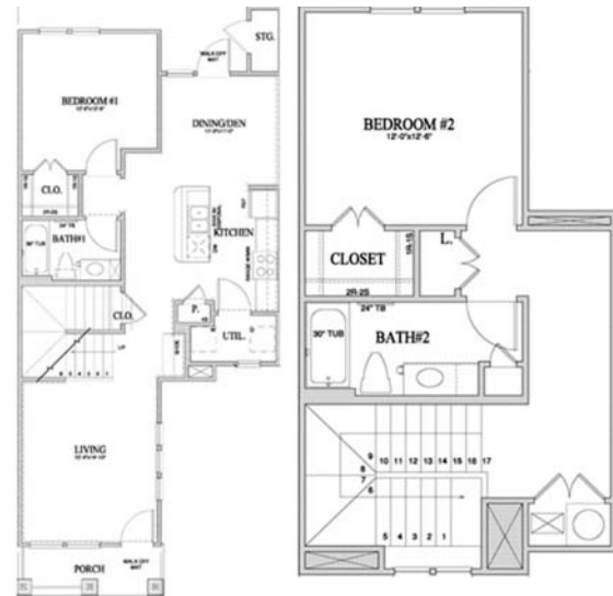
B2 2Bdrm/2Bath 1312Sq. Ft.*

*Square footage is approximate Actual floorplans may vary