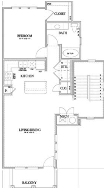
A2 1Bdrm/1Bath 1007Sq. Ft.*