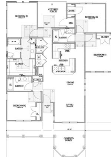
D1 4Bdrm/3Bath 1649Sq. Ft.*