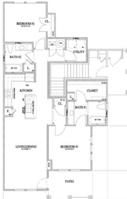
B3a 2Bdrm/2Bath 1156Sq. Ft.*