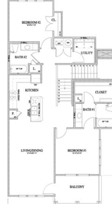
B3b 2Bdrm/2Bath 1278Sq. Ft.*