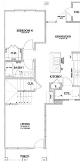
C1 3Bdrm/2Bath 1467 Sq. Ft.*